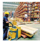
Warehouse & Cold Storage