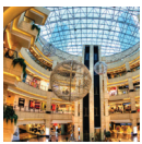
Shopping Mall & Commercial Buildings