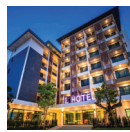
Hotels, Resorts & Restaurants