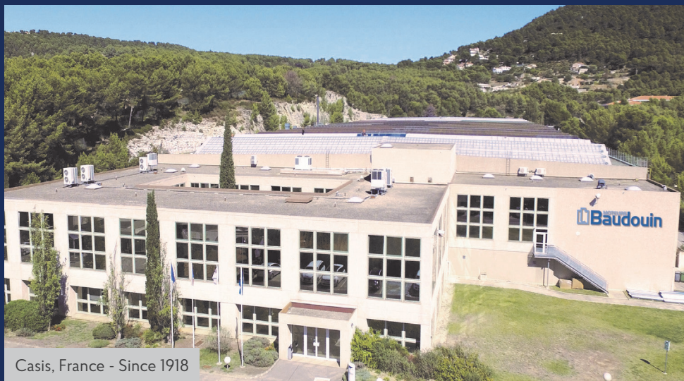
Casis, France - Since 1918

The Baudouin range of G Drive engines are available from 250 - 4000 kVA and are manufactured, distributed and serviced by Baudouin India team based at Pune, Maharashtra.